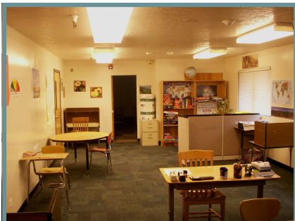
Classroom with Problem Lighting

This low, glaring classroom lighting at Holladay Annex is a good example which illustrates lighting that can create visual and attention problems for special education students.